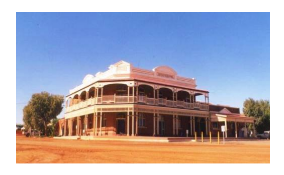
State Hotel at Gwalia of 1903 (Wikipedia).

Union Bank of 1889 on the corner of High and Cliff Streets, Fremantle (John Taylor, July 2008)